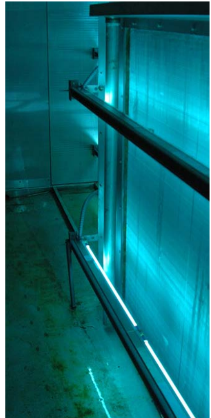
UVC lights shine on one of the air conditioning coils at the Delaware Biotechnology Institute.