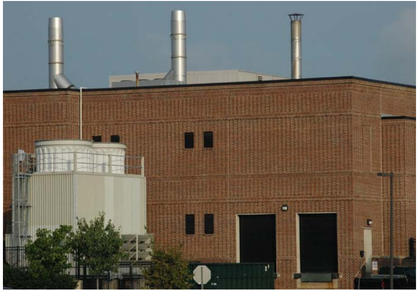
UVC-treated water produced by the air handlers during cooling season at the Delaware Biotechnology Institute on the campus of the University of Delaware is clean enough to be pumped into the cooling tower.